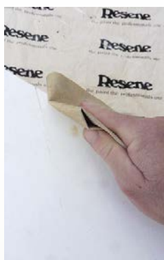
Step 1 Lightly sand the corner unit to 'key' the surface.