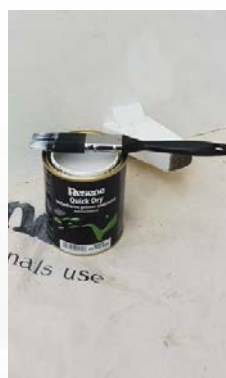
Step 4 Spot prime any areas of bare wood with Resene Quick Dry and allow to dry.