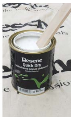
Step 3 Carefully stir the Resene Quick Dry.