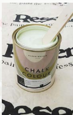
Step 5 Carefully stir the Karen Walker Chalk Colour tinted to Resene Cooled Green.