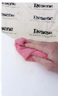
Step 2 Wipe off any sanding residue with a clean cloth.