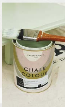
Step 7 Apply a second coat of Karen Walker Chalk Colour tinted to Resene Cooled Green to the corner unit and allow to dry.