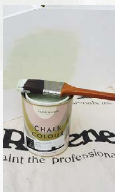
Step 6 Apply one coat of Karen Walker Chalk Colour tinted to Resene Cooled Green to the corner unit and allow to dry.