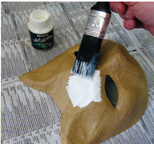
Step one Paint the cat mask with one coat of Resene Art Action Quick Dry and allow two hours to dry.