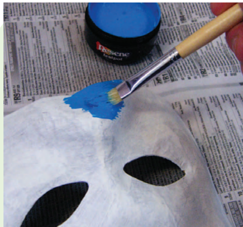
Step two Apply two coats of Resene Bowie to the mask, allowing two hours for each coat to dry.