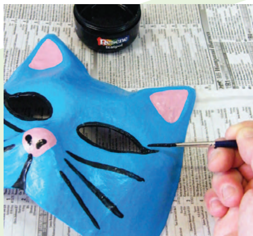
Step four Paint the remaining face details with Resene Nero, as shown, and allow two hours to dry. What a cool cat!

It's easy to turn a plain papier-mâché mask into a purr-fect masterpiece with a little bit of help from Resene.