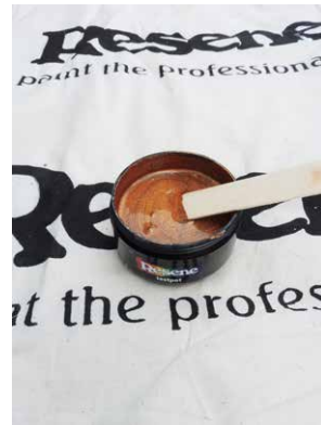
Step three Carefully stir the Resene Bullion with an ice block stick, as shown.