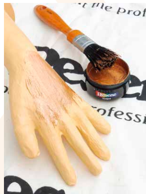
Step four Paint the paper maché hand with one coat of Resene Bullion and allow two hours to dry.