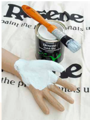
Step one Paint the paper maché hand with one coat of Resene Quick Dry and allow two hours to dry.