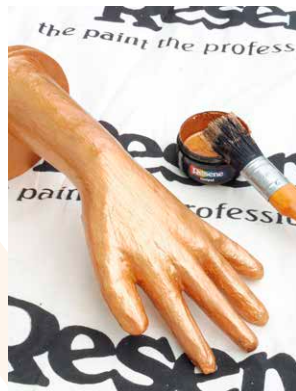
Step five Once again, carefully stir the Resene Bullion and apply a second coat to the paper maché hand. Allow two hours for the paint to dry.