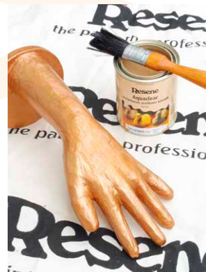
Step six To make the hand nice and shiny apply three coats of Resene Aquaclear, making sure you allow two hours for each coat to dry. So cool!

Create this fabulous golden hand and use it as a funky paintbrush stand or even as a display for your favourite jewellery.