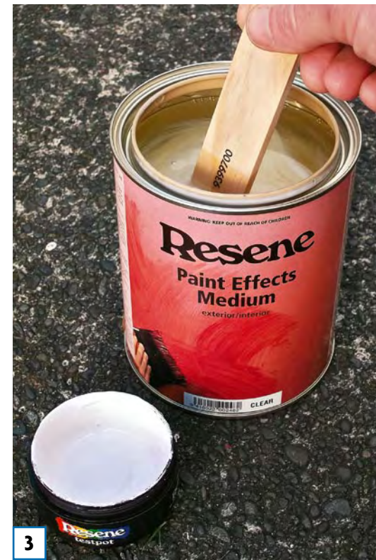
3 Pour a test pot of Resene Whiteout into the Resene Paint Effects Medium and mix thoroughly with a paint stirrer.