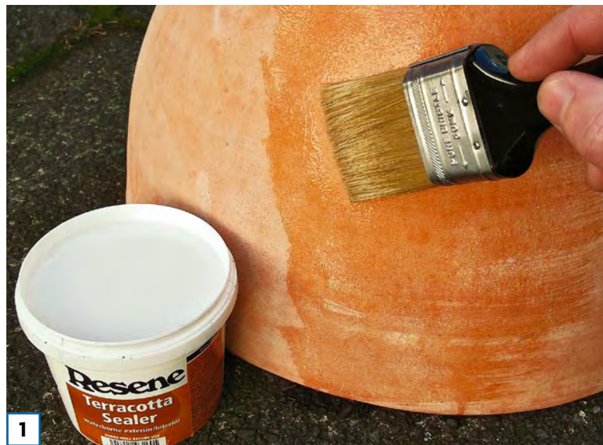
1 Apply one coat of Resene Terracotta Sealer to the pot inside and out and allow to dry.

Mark painted the background wall with Resene Lumbersider tinted to Resene Pale Prim.