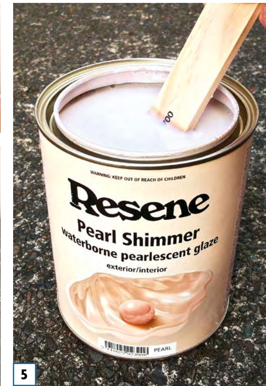
5 Carefully stir the Resene Pearl Shimmer waterborne pearlescent glaze with a paint stirrer.