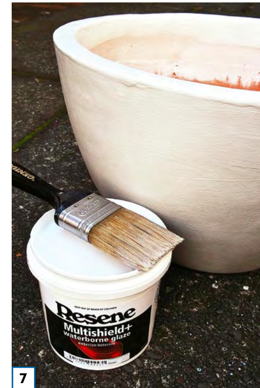
7 Apply three coats of Resene Multishield+ to the pot, allowing two hours for each coat to dry.