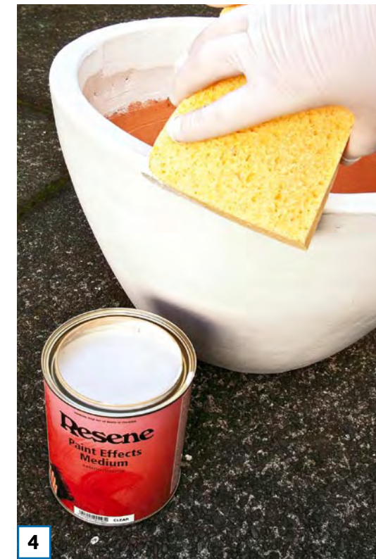
4 Wearing a latex glove, lightly sponge the Resene Paint Effects Medium in a random pattern on to the pot and allow to dry.