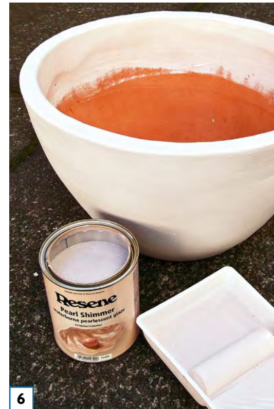
6 Using a roller, apply one coat of Resene Pearl Shimmer waterborne pearlescent glaze to the pot and allow to dry.