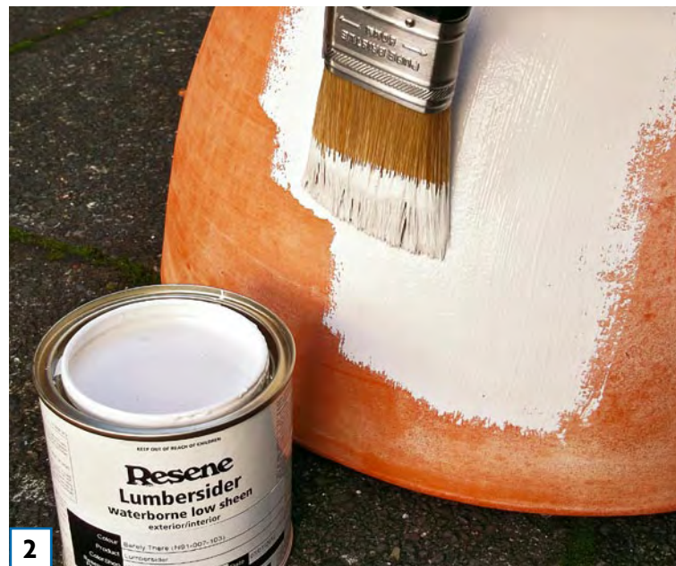
2 Apply two coats of Resene Barely There to the outside, top and inner rim of the pot, allowing two hours for each coat to dry.