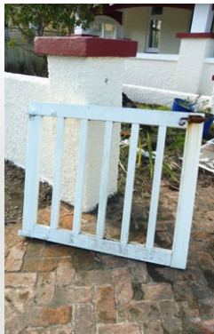
Step one Carefully lift the wooden gate from its hinges.