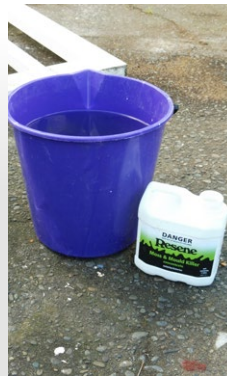
Step three Mix one part Resene Moss & Mould Killer to five parts clean water.