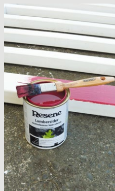
Step seven Apply two coats of Resene Vanquish to the gate, allowing two hours for each coat to dry.