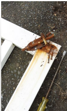
Step two Remove the old gate latch.