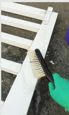
Step six Scrub the gate vigorously with the solution using a stiff-bristled brush and rinse off with clean water. Allow to dry.