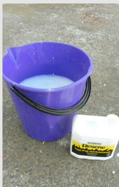
Step five Mix one part Resene Paint Prep and Housewash to three parts clean water.