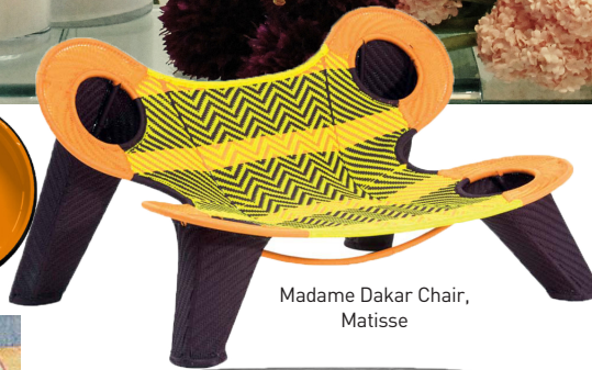
Madame Dakar Chair, Matisse