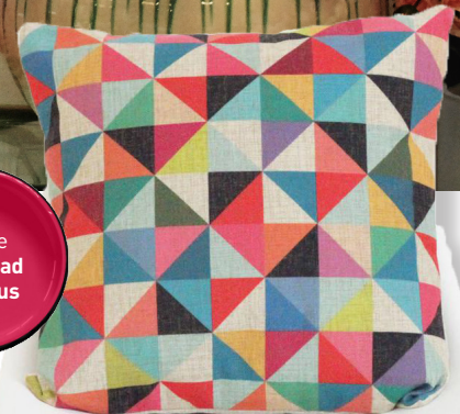
Geometric Cushion, Quirky Bee