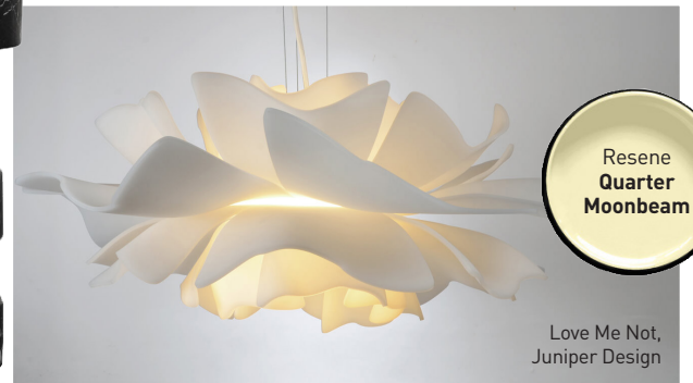
Resene Quarter Moonbeam