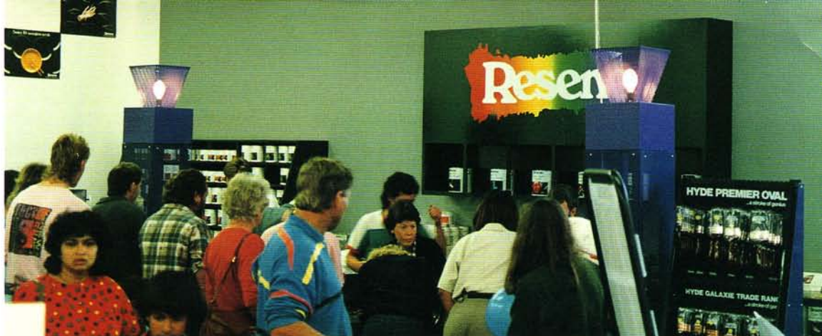
In an exciting morning of music, colour and barbecues, the Resene Color Shop opened its doors in Wanganui.