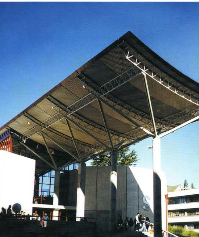
Student lecture theatres view from North East.

W aikato University's latest $4.8 million lecture theatre complex, designed by Robin Hannah, features a Resene Rolls Royce paint system with a 15 year guarantee. The three level complex consists of three pods which enclose four lecture theatres, seating from 80 to 140 students, and a full-height atrium providing both interconnection and entry points.