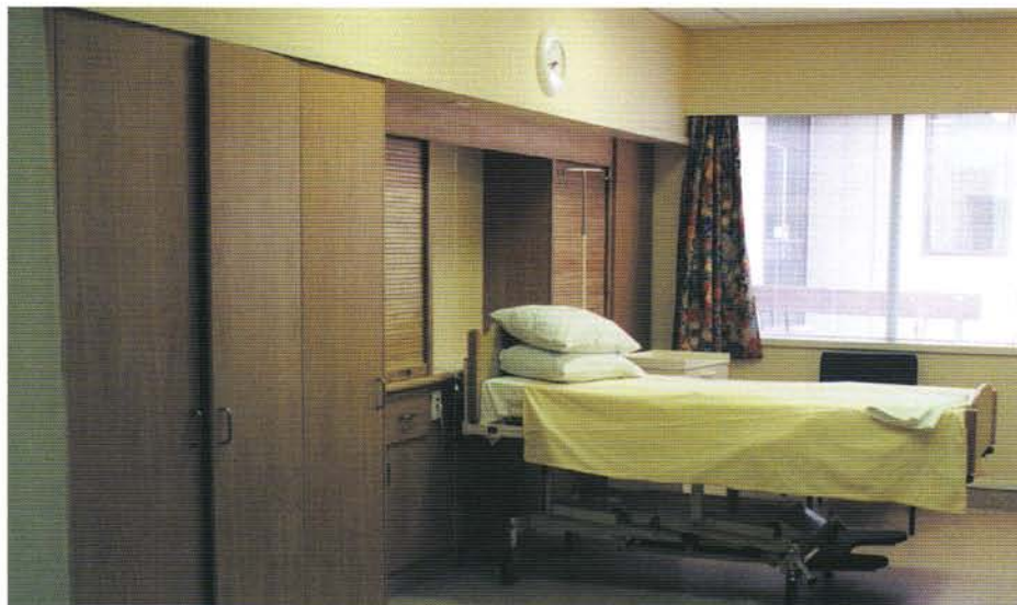
Wooden shutters are used to hide clinical items in maternity birthing rooms.