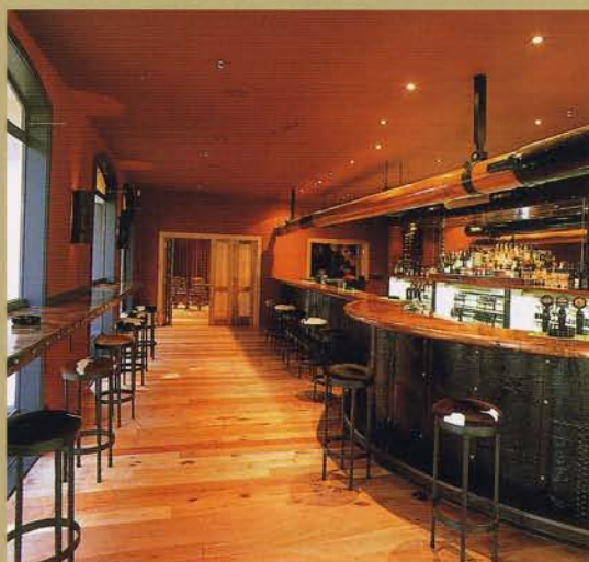
Fraser's bar capturing character and atmosphere.