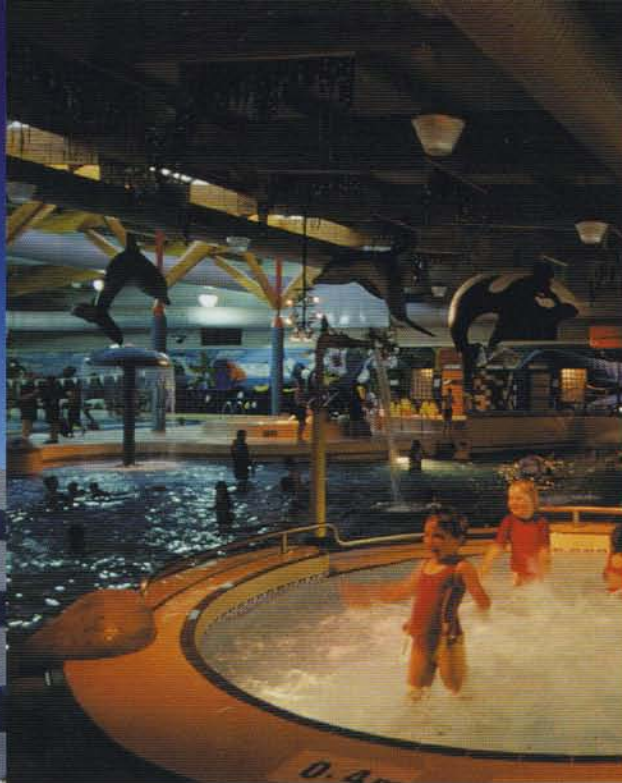
Left: Frequent use has been made of red steelwork. Right: Large dolphin and orca sculptures add to the nautical theme.

A lively environment has been created at the $7 million Porirua Trust Aquatic Centre where innovative architecture and colour enhances a nautical theme. The Aquatic Centre has to withstand some harsh treatment. As a result, Wellington architect Dennis Chippindale created a largely concrete, steel and glass structure using colour and shape to create some relief from the materials' ruggedness.