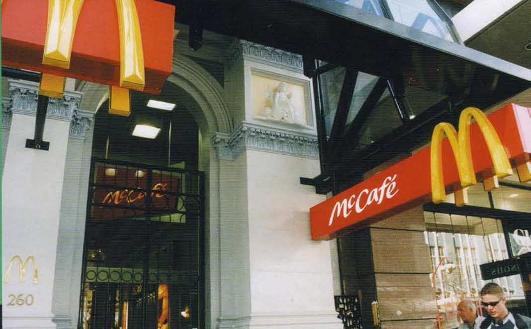
McCafé – restoring history.