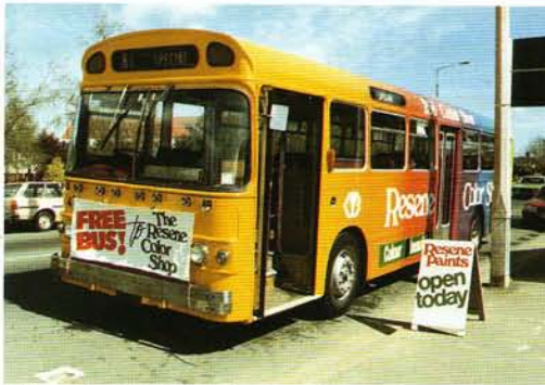
This splendid sight, the free bus to the new Colour Shop in Christchurch, was hard to miss.