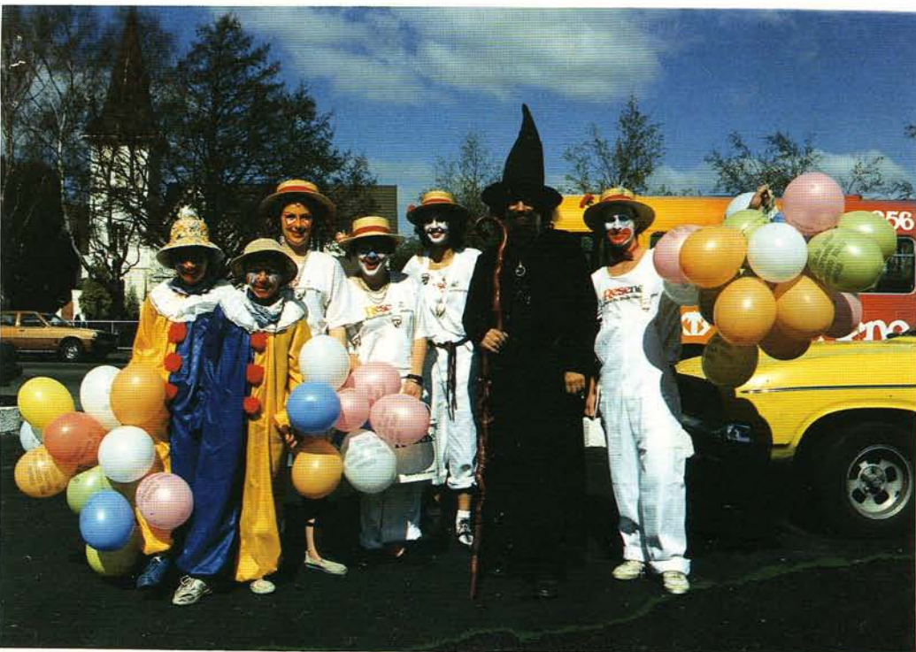
The Wizard and the Resene Clowns cook up a blaze of colour during the opening ceremony.