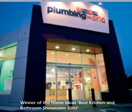
Winner of the Home Ideas 'Best Kitchen and Bathroom Showroom 2002'

PLUMBING WORLD Recognising women as the primary decision makers for their domestic business, Plumbing World stores nationwide required rebranding to make them more fashion orientated and appealing to women. Seeking a more modern and sophisticated presence, purple tinted into Resene Lumbersider satin acrylic was selected as the main branding colour for all 40 stores. The original icon colours red, blue, green and orange were retained inside to highlight the different product departments. Resene metallics were used on detail to give a leading edge look throughout the stores accompanied by Resene Zylone Sheen low sheen tinted to the