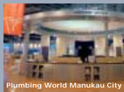
Plumbing World Manukau City

Plumbing World special colour palette. All stores were visited as part of the specification process to ensure each was tailored to individual building needs. In a bold leap of faith, Plumbing World have well and truly laid out the welcome mat to women.