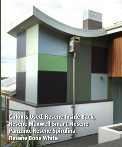
Colours Used: Resene Inside Back, Resene Maxwell Smart, Resene Panzano, Resene Spirulina, Resene Bone White

The Buchanan Residence integrates old with new with ease. A clever patchwork of colours you would see in nature near the entry subtly leads you inside while also being reflective of the surrounding landscape. The external colour scheme was required to deliver on many levels. It needed to be respectful of the surrounding lake setting and landscape when viewed from the lake. Up close, it was to offer a rich diversity of colour and texture and, unlike most properties, it also needed to be presentable when viewed from above as the driveway descends on the house above the roof-line. The client's dislike of blue led to green and brown cues taken from the surrounding lake-scape for the feature cladding near the entry.