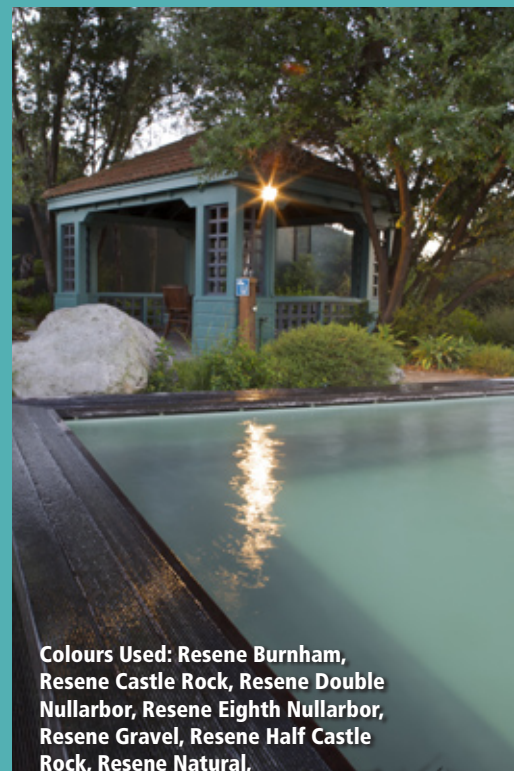
Colours Used: Resene Burnham, Resene Castle Rock, Resene Double Nullarbor, Resene Eighth Nullarbor, Resene Gravel, Resene Half Castle Rock, Resene Natural, Resene Stromboli

The buildings and landscape of the Polynesian Spa in Rotorua rest on an active thermal site providing one of the harshest environments possible for building materials and vegetation. Gas membranes are situated below most construction and under the Lake Spa bush gardens. Paint colours are sympathetic and appropriately thermal in nature. The colour scheme makes the water feel soft, calling you into its depths.