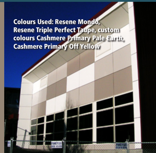
Colours Used: Resene Mondo, Resene Triple Perfect Taupe, custom colours Cashmere Primary Pale Earth, Cashmere Primary Off Yellow

Natural materials such as clear finished and stained rough sawn ply enable the materials to be detailed with little fuss. They create a contrast to the glass reinforced concrete elements and resonate with the Hynds Group business philosophy of honest, straightforward, no-nonsense "what you see is what you get" service and solutions. The project demonstrates a very accomplished application of colour with the use of wood creating a nice mood. They used colour to telling effect.