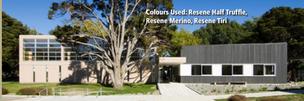
Colours Used: Resene Half Truffle, Resene Merino, Resene Tiri