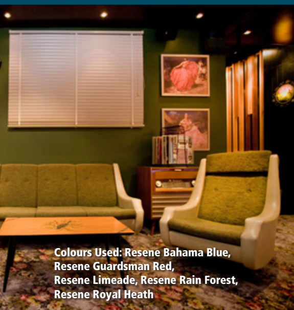
Colours Used: Resene Bahama Blue, Resene Guardsman Red, Resene Limeade, Resene Rain Forest, Resene Royal Heath

The Whanganui Regional Museum explored the six photoelectric colours; black, red, blue, yellow, green and white. Visitors move through six discrete spaces, each with walls painted one of those colours. The effect of creating the coloured rooms is two-fold. The colour emphasises the relationships between the artworks and artefacts, and also their relationships with the colour. Each space also affects the visitor. The emotional impact of being in the 'red room' is very different to that in the 'blue room'. The journey through each of the coloured areas provides each visitor with an opportunity to not only engage with a variety of artworks and artefacts, but also to examine their own emotional responses to the immersive experience of colour. This project is almost simplistic, but yet bold. It is strong and has great clarity. In a museum setting that's pitched to its audience, it is very effective and provocative.