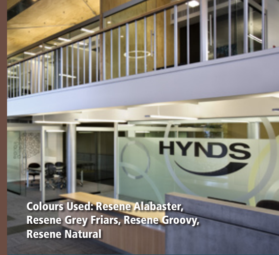
Colours Used: Resene Alabaster, Resene Grey Friars, Resene Groovy, Resene Natural

Xsite Architects were awarded a Resene Total Colour Commercial Interior Maestro Award for the Hynds Group Headquarters renovation.