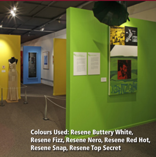
Colours Used: Resene Buttery White, Resene Fizz, Resene Nero, Resene Red Hot, Resene Snap, Resene Top Secret