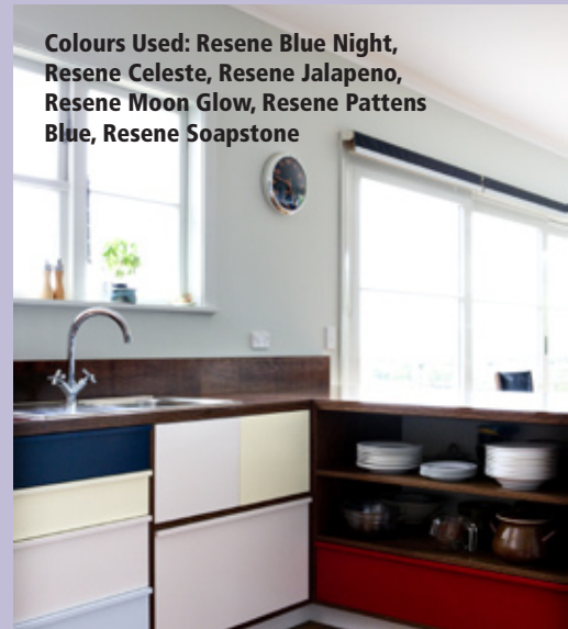
Colours Used: Resene Blue Night, Resene Celeste, Resene Jalapeno, Resene Moon Glow, Resene Pattens Blue, Resene Soapstone

Renovations for this kitchen came straight from the influences of Piet Mondrian's renowned block-colour artworks. In keeping with the Art Deco style of the original house, this kitchen has blended effortlessly with the existing detailing and client's vibrant Deco furnishings. The simple linear shapes and staggered block-colour arrangements were the perfect canvas for painting bold and stylish Resene colours. In collaboration with the client, the final colours and their arrangement were key decisions aided by 3D CAD images and Resene colour swatches and testpots. A unique, clever palette of colours, mixed and matched with care for an original styled effect.