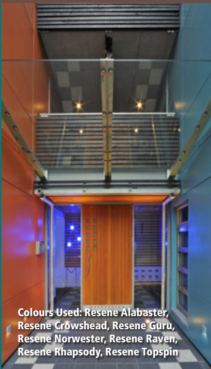
Colours Used: Resene Alabaster, Resene Crowshead, Resene Guru, Resene Norwester, Resene Raven, Resene Rhapsody, Resene Topspin

that this will be built in transportable units that can be built and then transported or shipped to the site. This design is a three bedroom residence comprising of two separate pavilions that are connected by a boardwalk style decking. This allows the owner to separate living and bedroom areas. Three colour schemes are proposed that will be available to give people choice and the opportunity to personalise their home. The vibrant use of colour gives the residents a clean, fresh environment.