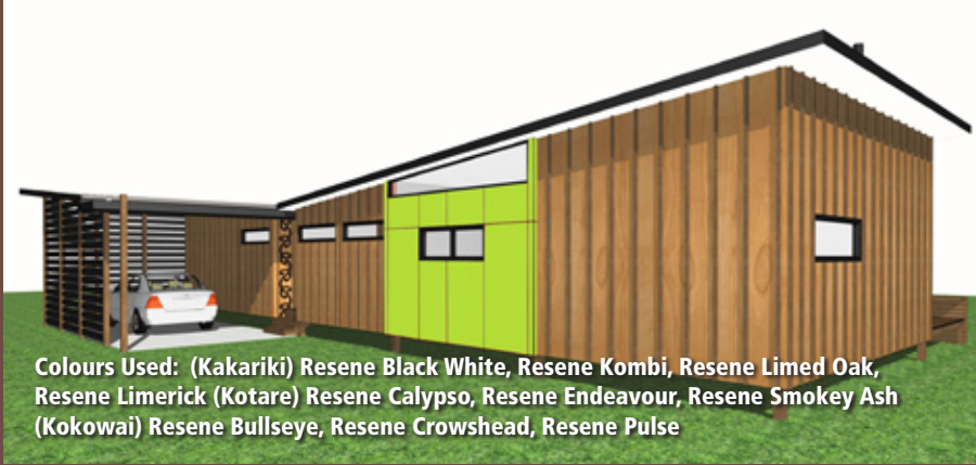
Colours Used: (Kakariki) Resene Black White, Resene Kombi, Resene Limed Oak, Resene Limerick (Kotare) Resene Calypso, Resene Endeavour, Resene Smokey Ash (Kokowai) Resene Bullseye, Resene Crowshead, Resene Pulse