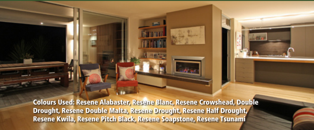
Colours Used: Resene Alabaster, Resene Blanc, Resene Crowshead, Double Drought, Resene Double Malta, Resene Drought, Resene Half Drought, Resene Kwila, Resene Pitch Black, Resene Soapstone, Resene Tsunami