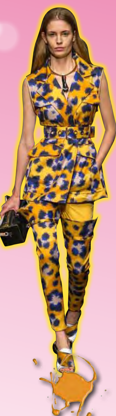
Resene Fuel Yellow Kenzo