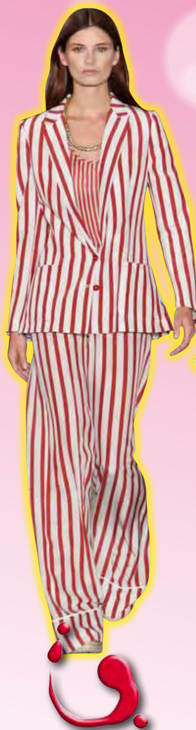
Resene Red Tape Tommy Hilfiger