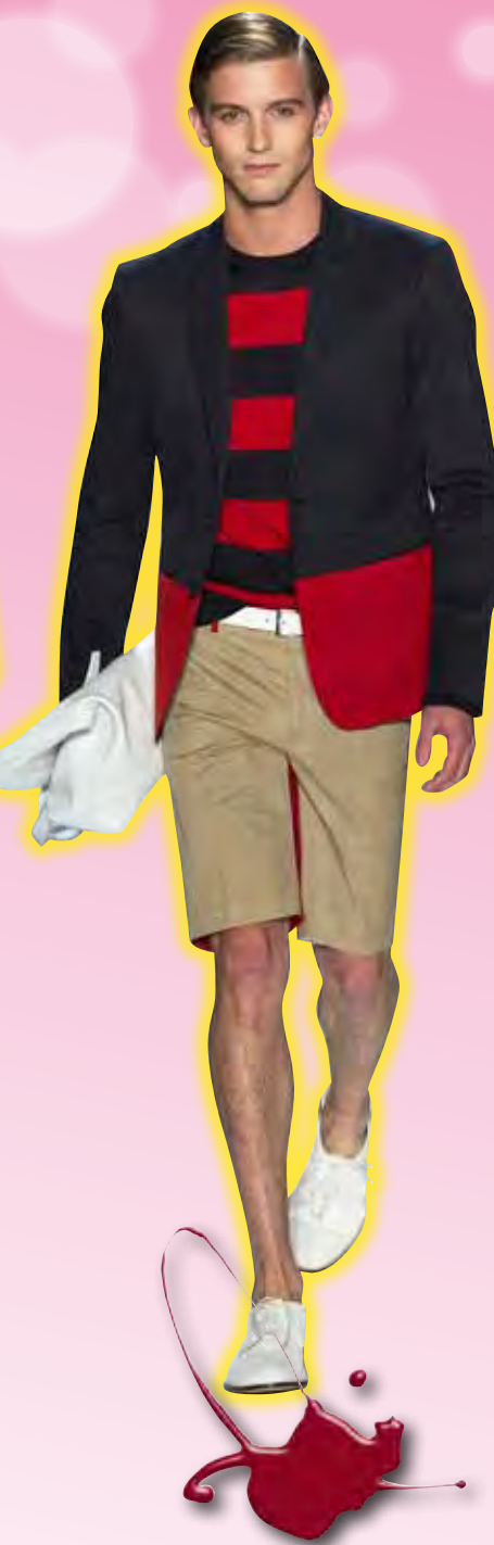
Resene Salsa Michael Kors