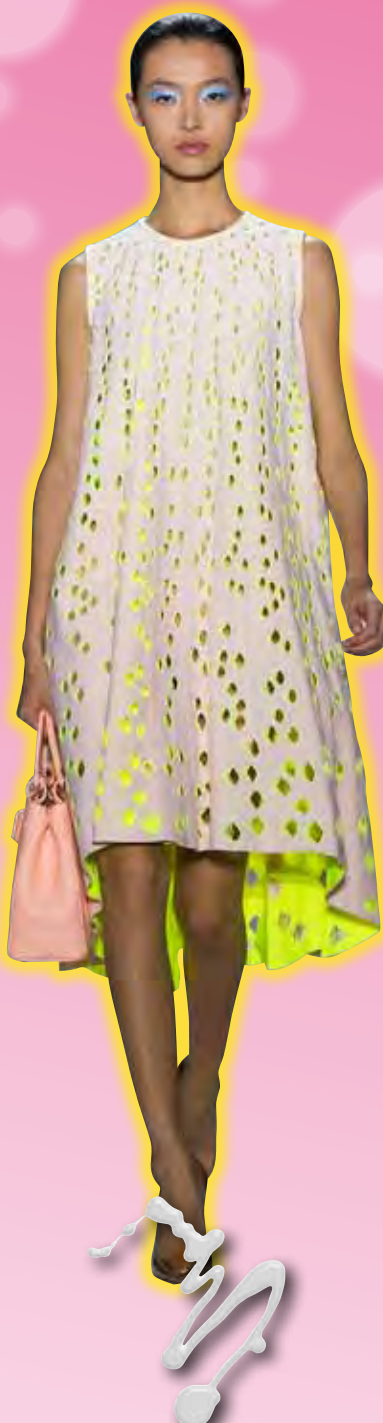
Resene White Thunder Christian Dior