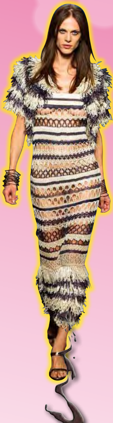
Resene Stingray Jean Paul Gaultier