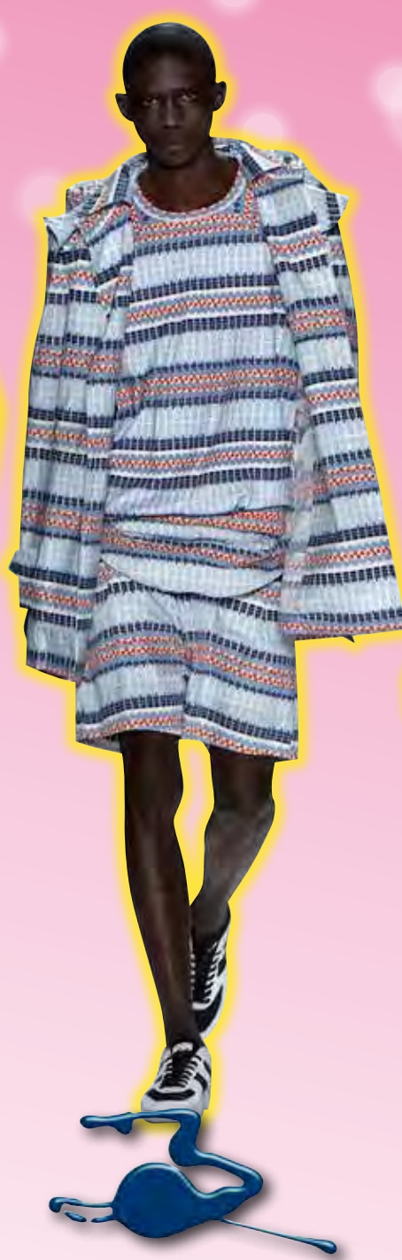
Resene Whale Tail Lacoste