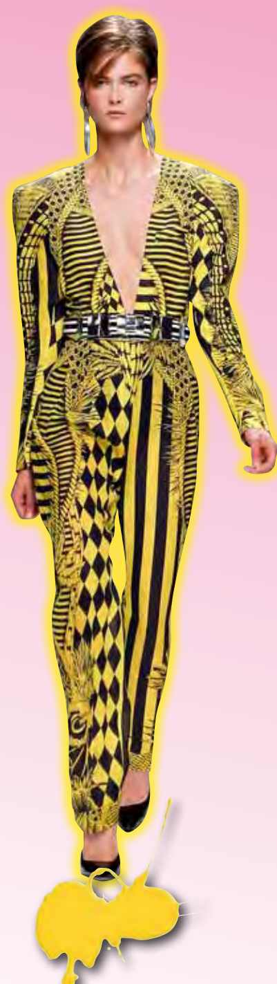
Resene Wild Thing Balmain