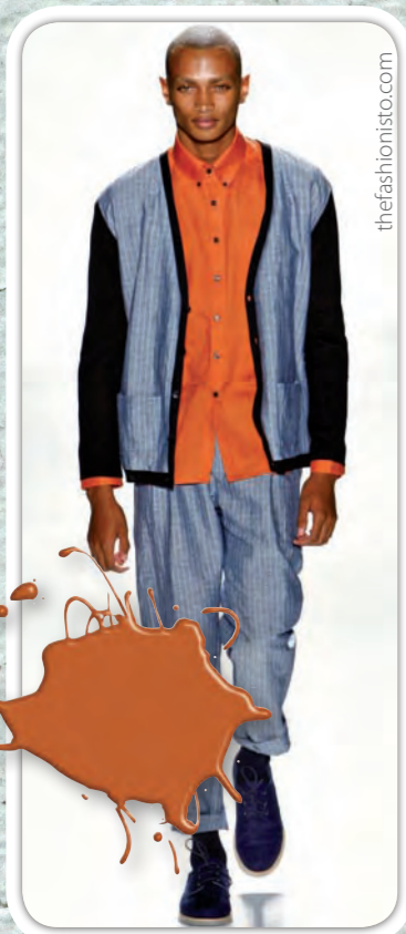
Resene Clockwork Orange Timo Weiland