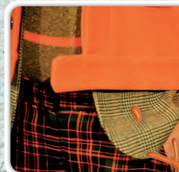
Resene Outrageous J-Crew

Along with the tie as a way for men to show hints of individual expression, the dandy revival of the pocket square is providing a second tool for refreshing an outfit with a world of colour.