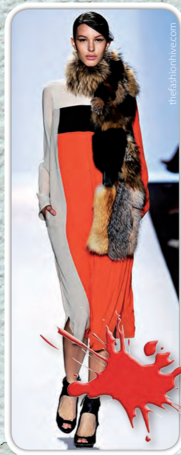
Resene Pursuit BCBG