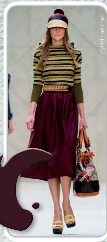
Resene Kea (top) Resene Jumpstart (bottom) Burberry