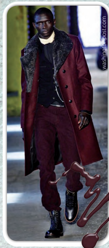
Resene Courage Rag & Bone