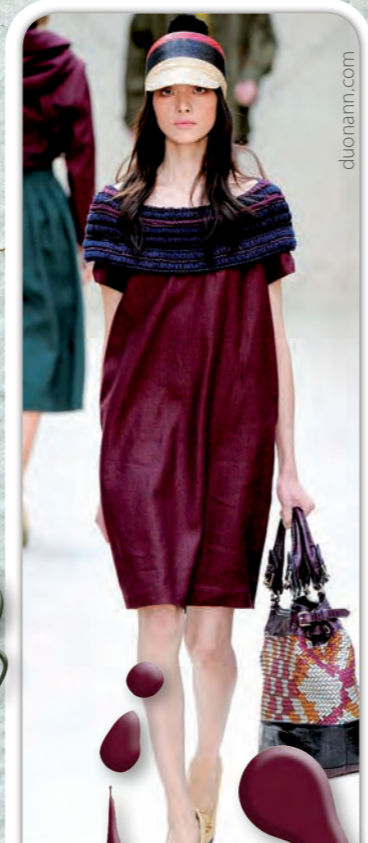
Resene Breakfree Burberry