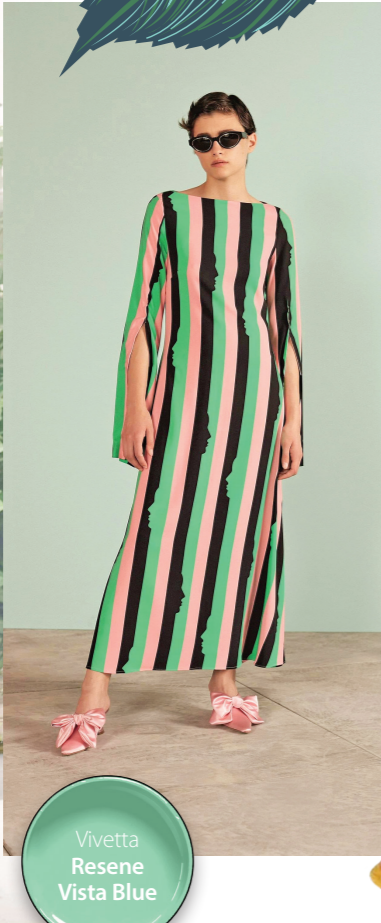
Vivetta Resene Vista Blue