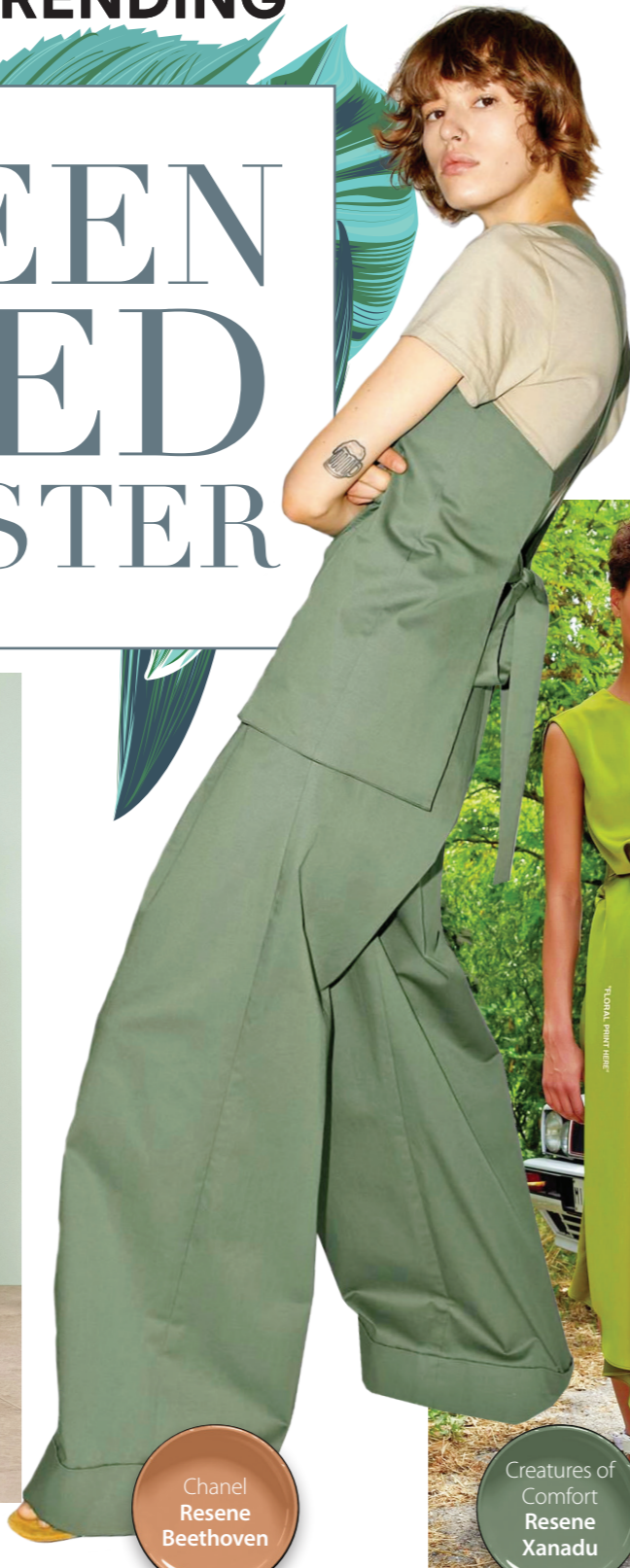
Chanel Resene Beethoven