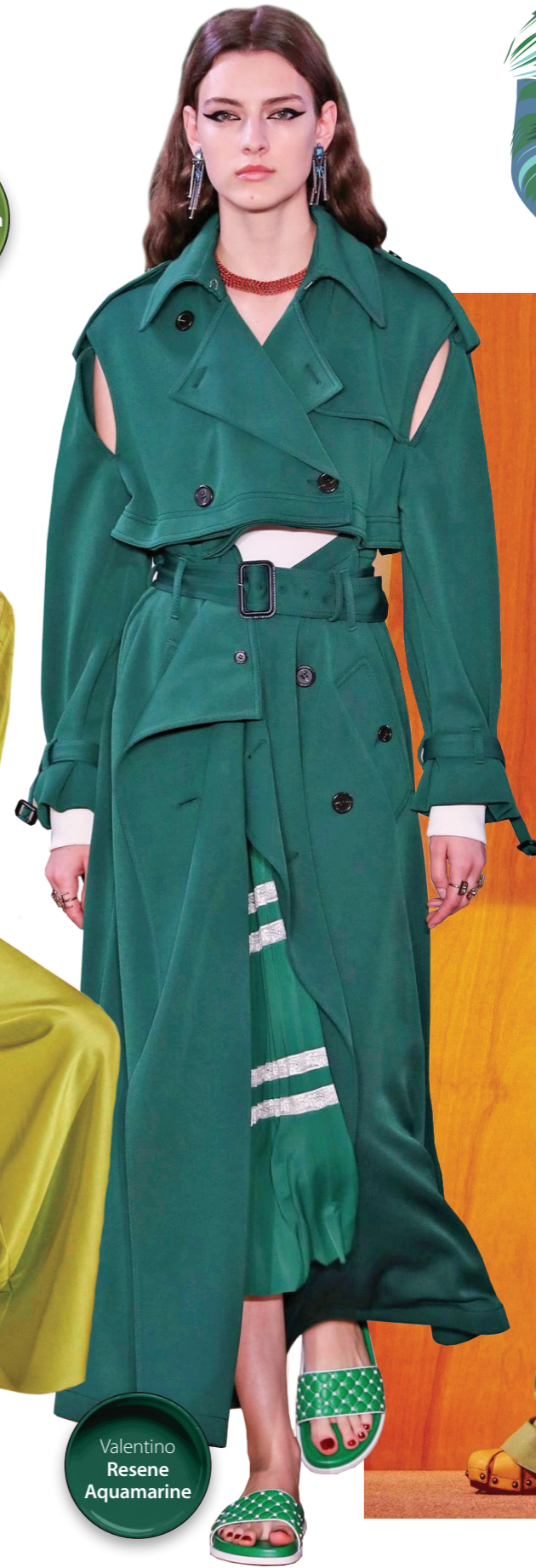
Valentino Resene Aquamarine