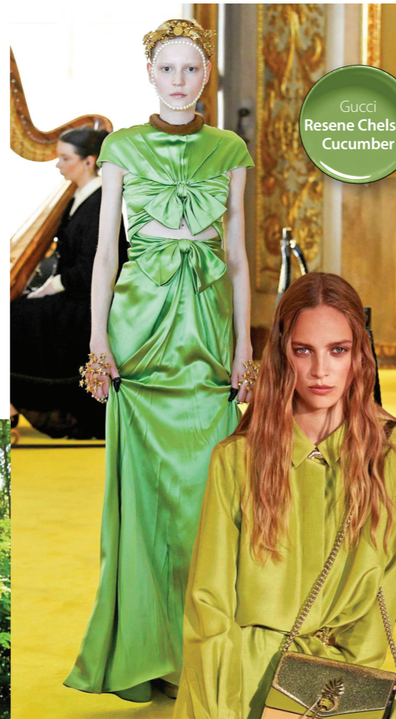
Gucci Resene Chelsea Cucumber