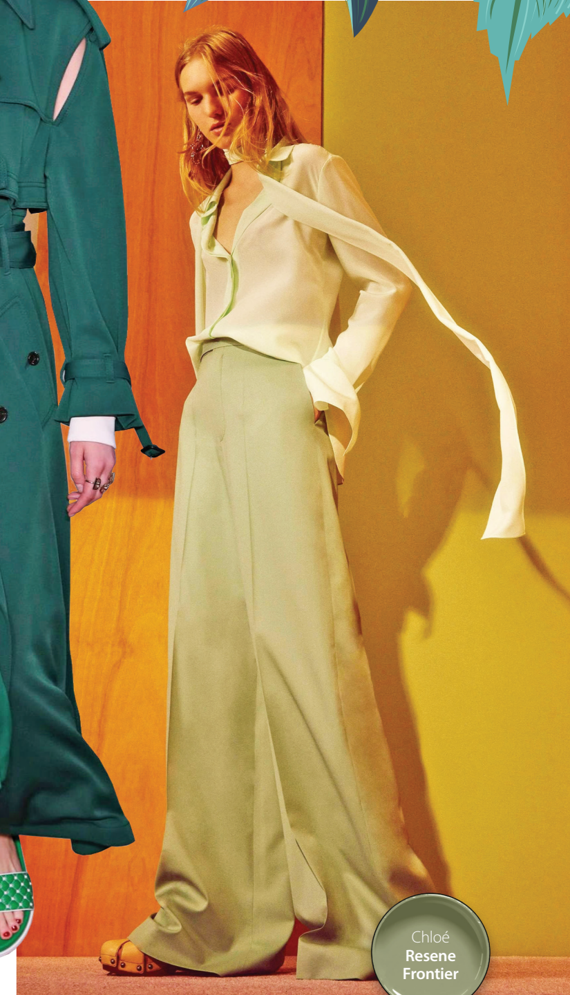
Chloé Resene Frontier

If Alexa Chung and Miuccia Prada vacationed together in Los Angeles and then designed a collection based on their experience - Vivetta's aesthetic would be the result. Steeped in trends, the Cruise 2018 collection was a mod fashion girl's fantasy, with statement pieces galore and an effervescent selection of colours. Gingham, puffed sleeves, embroidered patches and kitten heels all piled in on top of each other - the epitome of extra. Combined with candy-fresh tones, from apple red to Resene Vista Blue, the collection was steeped in retro-Californian vibes.