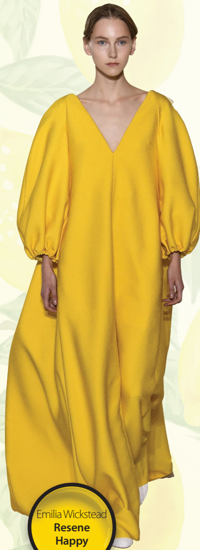
Emilia Wickstead Resene Happy