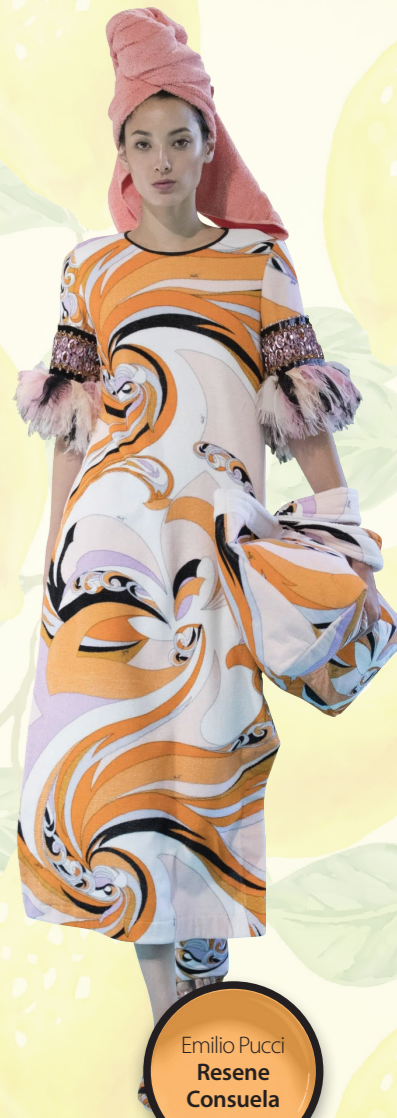
Emilio Pucci Resene Consuela

several appearances, in a colour close to Resene Sebedee juxtaposed with complementary marigold yellow accents. Toggles are also having a moment in the sun, although the jandal stilettos were more divisive and probably won't catch on.