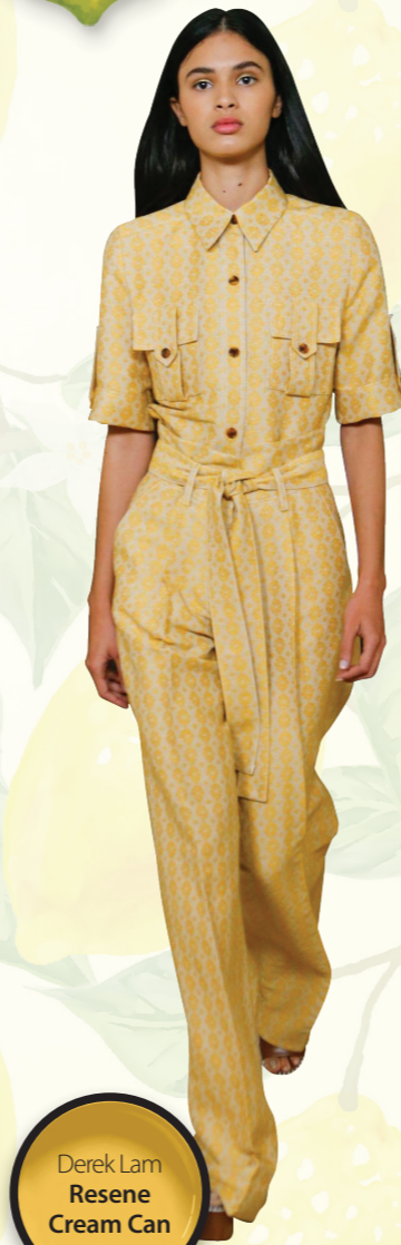
Derek Lam Resene Cream Can