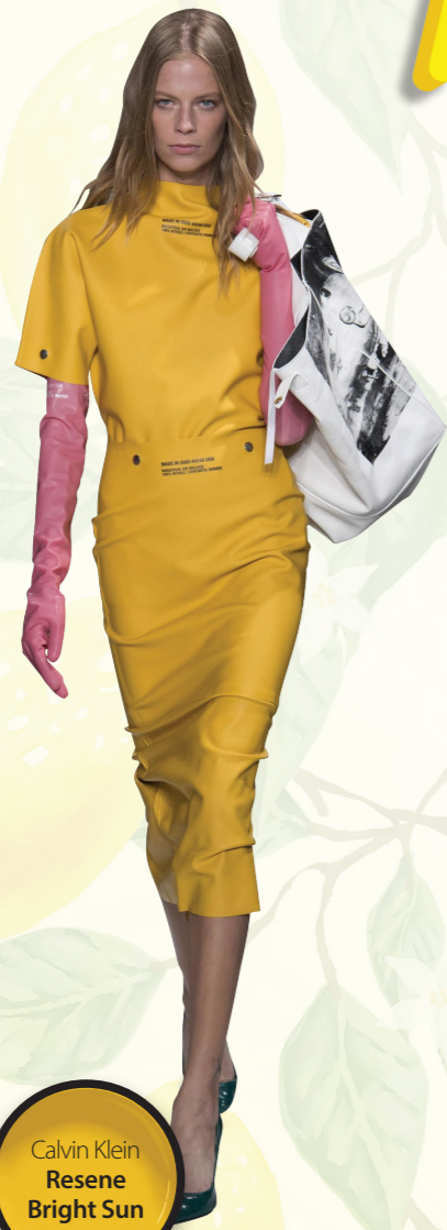
Calvin Klein Resene Bright Sun