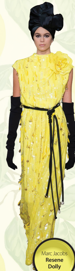
Marc Jacobs Resene Dolly