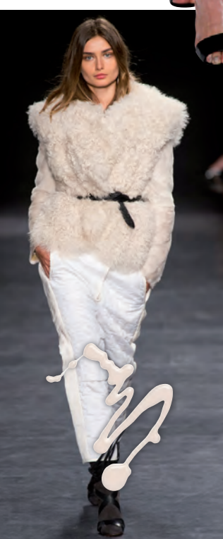
ISABEL MARANT RESENE Springwood

Colours available from Resene ColorShops www.resene.co.nz 0800 737 363