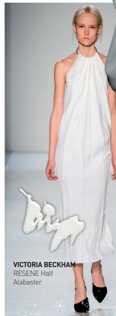
VICTORIA BECKHAM RESENE Half Alabaster