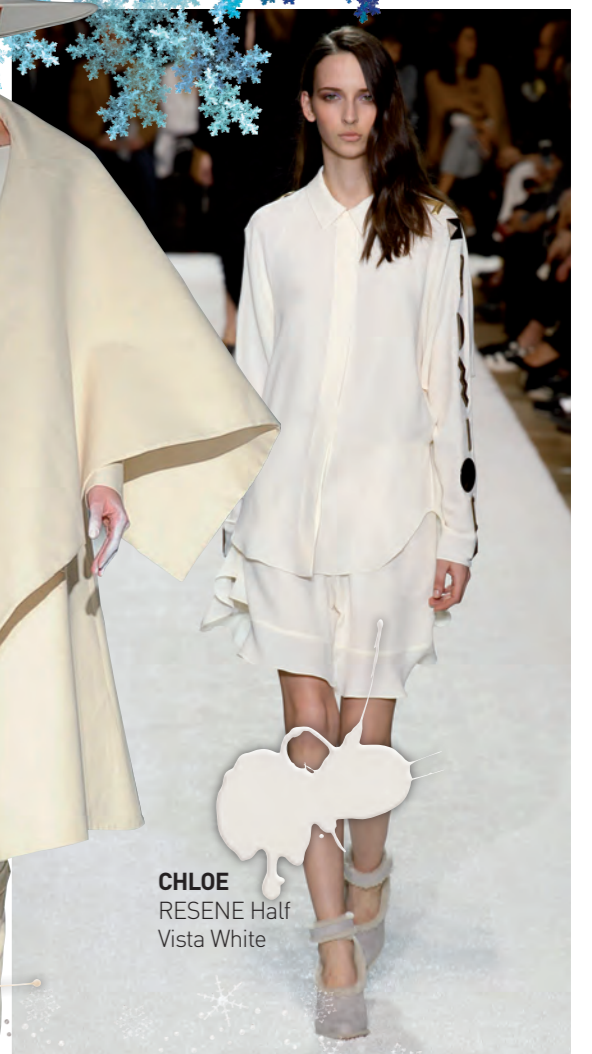
CHLOE RESENE Half Vista White