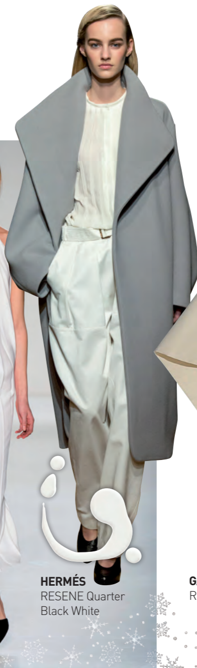
HERMÉS RESENE Quarter Black White