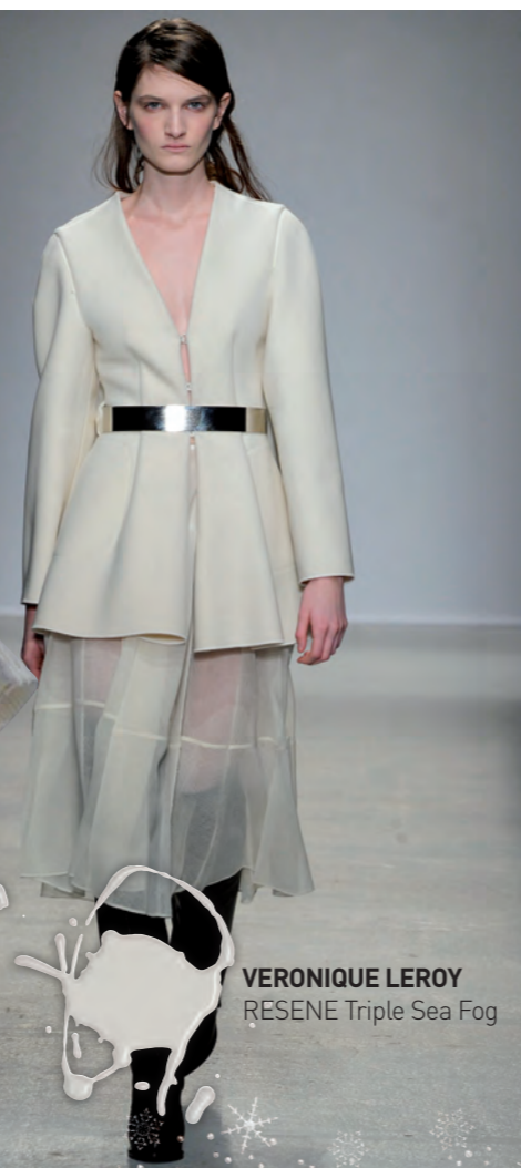
VERONIQUE LEROY RESENE Triple Sea Fog