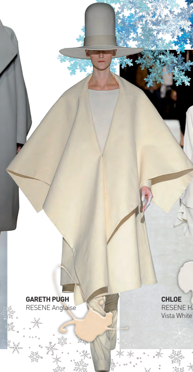
GARETH PUGH RESENE Anglaise