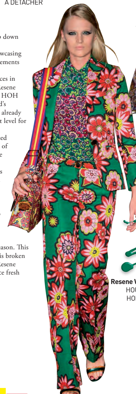
Resene Watercourse HOUSE OF HOLLAND