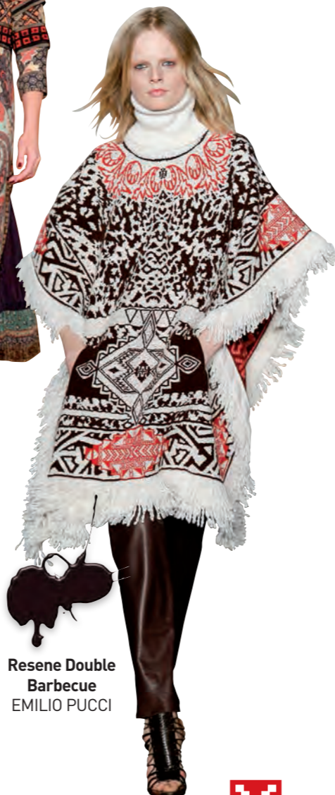
Resene Double Barbecue EMILIO PUCCI