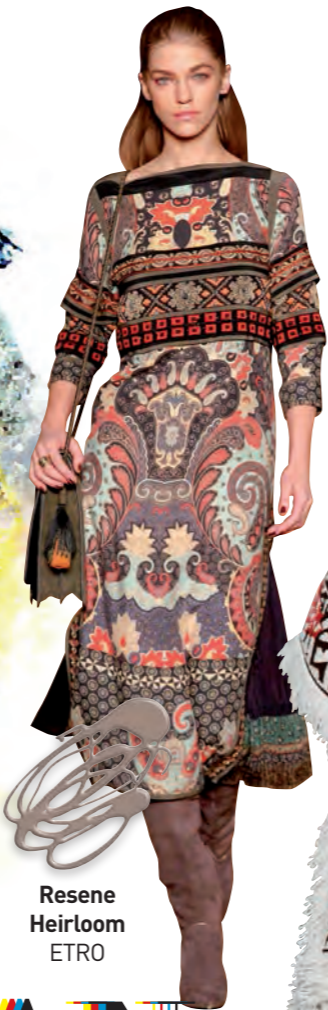
Resene Heirloom ETRO