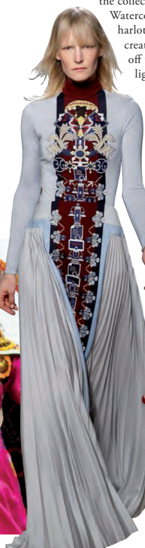
Resene Red Planet MARY KATRANTZOU