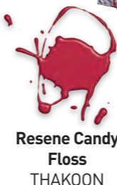
Resene Candy Floss THAKOON