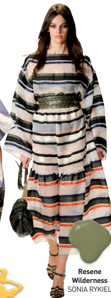
Resene Wilderness SONIA RYKIEL