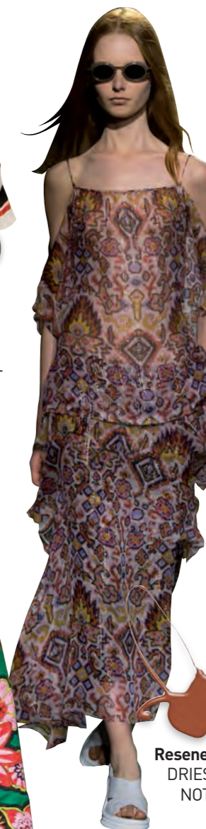
Resene Twizel DRIES VAN NOTEN