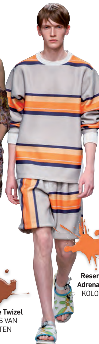
Resene Adrenalin KOLOR

greys in this collection are suitably named for Etro's trip down memory lane in the exploration of Italian classics. House of Holland created a psychedelic pantsuit, showcasing an array of neons and floral prints that mixed natural elements with synthetic influence. This floral print is a downplayed outfit in comparison to other pieces in the collection, with a green similar to Resene Watercourse. Described as "a gang of HOH harlots," the models carried Holland's creations with attitude, taking the already off the walls collection to the next level for light comedic relief.