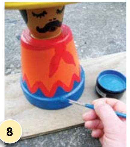
8 Paint a band around the base, as shown, using two coats of Resene Bondi Blue, allowing two hours for each coat to dry.