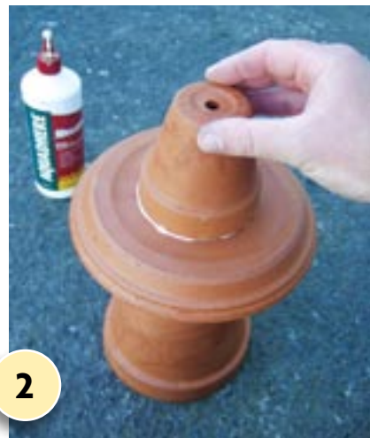
2 Glue a smaller pot to the base of the larger pot (to form the head and body), followed by the pot saucer and another smaller pot to form the hat. Allow glue to dry.