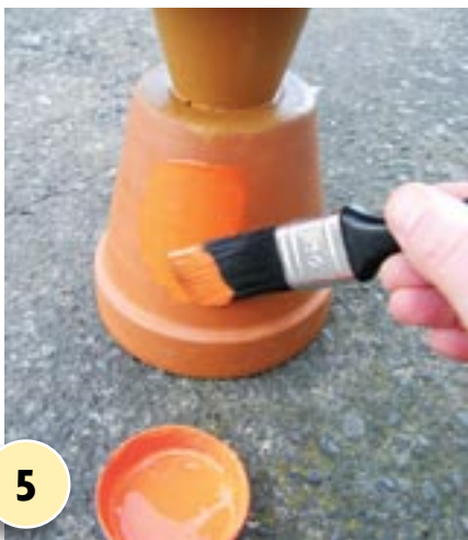
5 Paint the body with two coats of Resene Balloon, allowing two hours for each coat to dry.