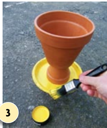
3 Paint the hat with two coats of Resene Galliano, allowing two hours for each coat to dry.