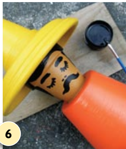
6 Paint face details with Resene Black and lips with Resene Cioccolato.