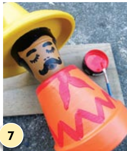
7 Paint the knotted bandana and the zig-zag pattern on the body with Resene Bright Red.