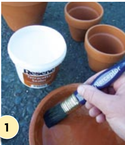
1 Seal the terracotta pots and saucer with one coat of Resene Terracotta Sealer and allow to dry.

Other ideas: To create a shiny look, apply one coat of Resene Mutishield + gloss once the paints have dried.