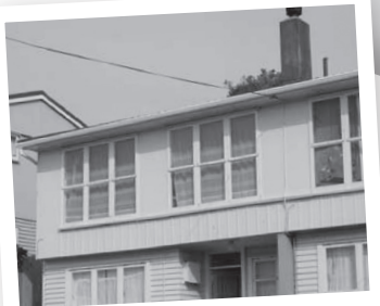
Shows asbestos containing cladding on the upper exteriors and soffits as well as the gable end

When undertaking maintenance painting of any structure in which any of the substrates above are present, questions re the age of the