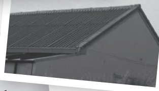
Shows asbestos containing roofing and wall cladding