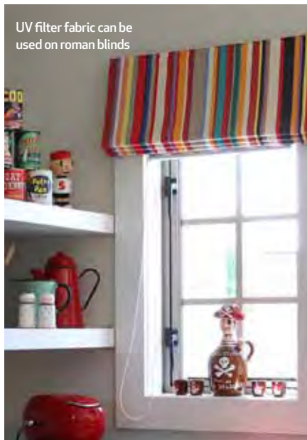
UV filter fabric can be used on roman blinds

FOR KITCHENS AND BATHROOMS, MAKE SURE THEY CAN BE WIPED DOWN