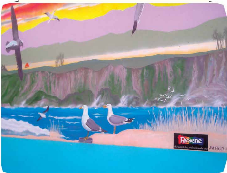
Alpha Support Centre, Christchurch