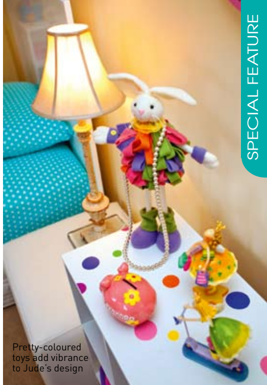
Pretty-coloured toys add vibrance to Jude's design