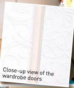
Close-up view of the wardrobe doors