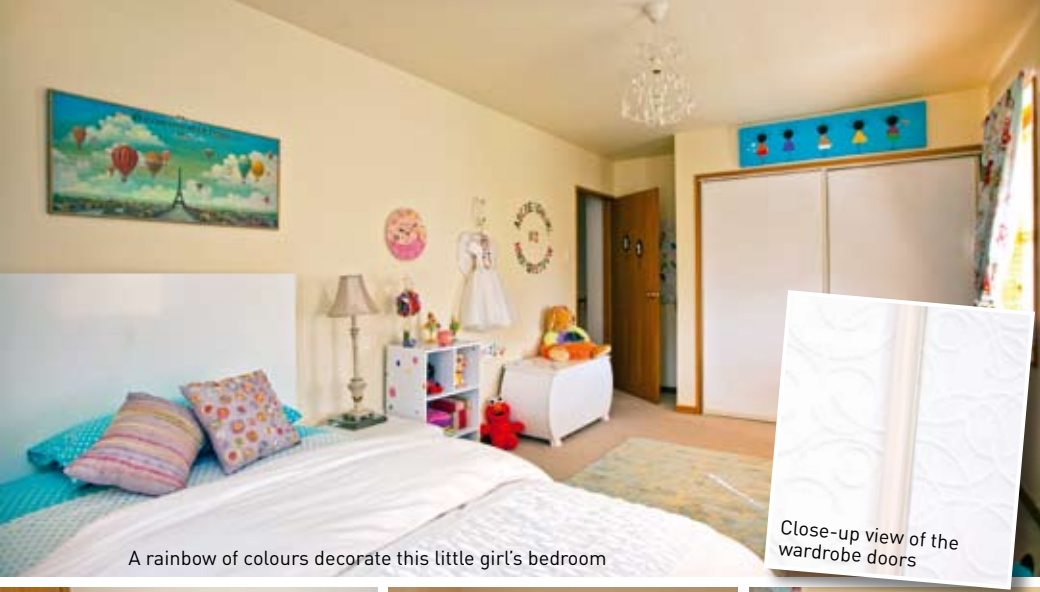
A rainbow of colours decorate this little girl's bedroom