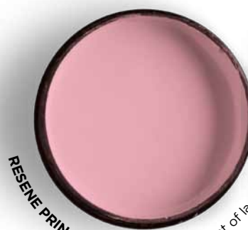
RESENE PRINCESS is a pink reminiscent of lace and a pretty face.