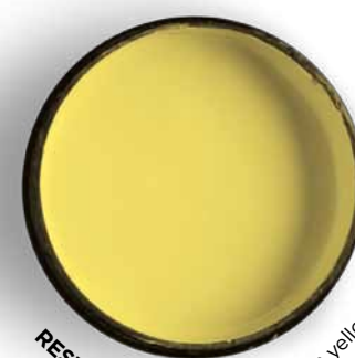
RESENE SMILE is a crisp clean yellow

FOR MORE IDEAS AND INSPIRATION visit your Resene ColorShop, 0800 RESENE (737 363) or visit www.resene.co.nz