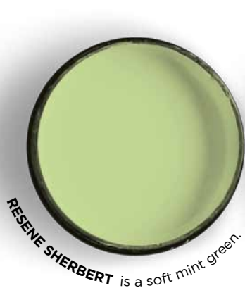
RESENE SHERBERT is a soft mint green.