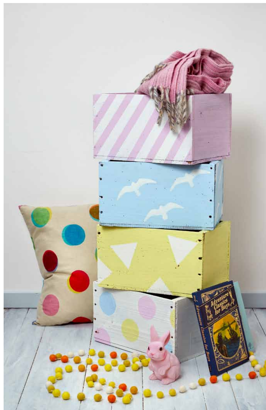
PROPS COLLECTED BY LeeAnn Yare STYLING Leigh Stockton

Colour, special effects and simple craft ideas are all easy ways of adding zing to your child's bedroom. With a huge array of colours, tips and tricks, Resene makes it easy to brighten things up!