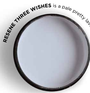
RESENE THREE WISHES is a pale pretty lavender blue