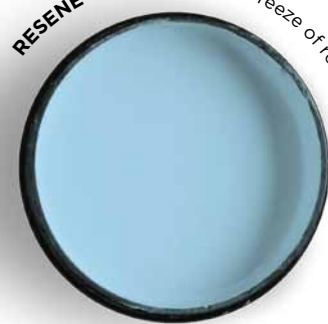
RESENE SPLAT is a clear breeze of regatta blue.