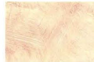
Colourwashed Fedora™ PEM over Wheatfield™ basecoat