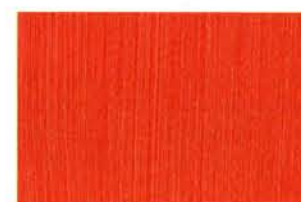
Colourwashed Dynamite™ PEM over Tuscany™ basecoat