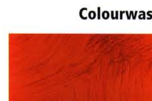
Colourwashed California™ PEM then ragrolled Gold Effects over Bardot™ basecoat