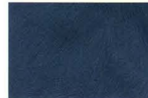
Colourwashed Mulled Wine™ PEM over Gravel™ basecoat