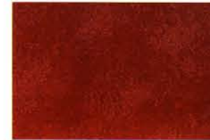
Sponged Shiraz™ PEM over Lusty™ basecoat