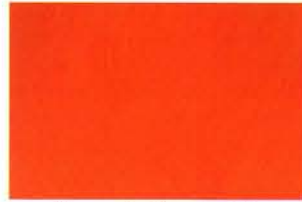
Limewashed Lusty™ PEM over Tuscany™ basecoat