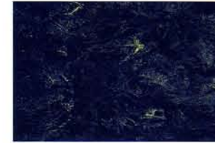
Ragrolled Gold Effects over Outer Space™ basecoat