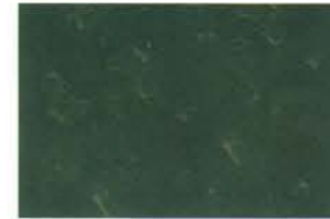
Ragrolled Stonewall™ PEM over Gravel™ basecoat