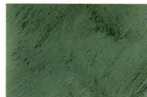
Limewashed Eternity™ PEM texture over Friar Grey™ basecoat