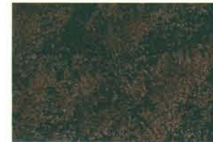
Sponged Fire™ PEM over Gravel™ basecoat