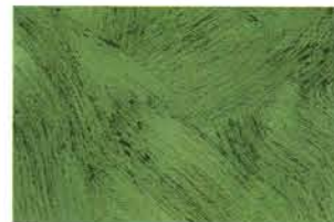
Limewashed Eternity™ PEM texture over Double Lemon Grass™ basecoat