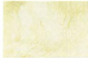
Limewashed Tea™ PEM over Half Spanish White™ basecoat