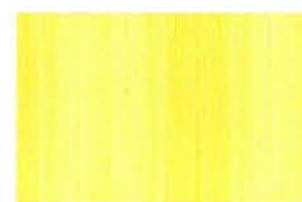
Dragged Gold Effects over Wheatfield™ basecoat