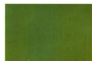
Dragged Rusty Nail™ PEM over Gravel™ basecoat