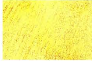
Limewashed Tussock™ PEM texture over Barley White™ basecoat