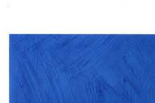
Colourwashed Vortex™ PEM over Mariner™ basecoat