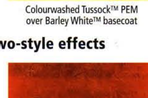
Sponged Shiraz™ PEM then ragrolled Gold Effects over Fire™ basecoat