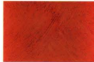
Limewashed Dynamite™ PEM texture over Sante Fe™ basecoat