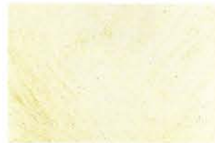
Limewashed Tea™ PEM texture over Half Spanish White™ basecoat