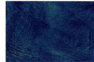
Colourwashed Sushi™ PEM over Outer Space™ basecoat