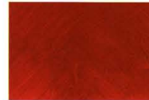
Colourwashed Fire™ PEM over Lusty™ basecoat