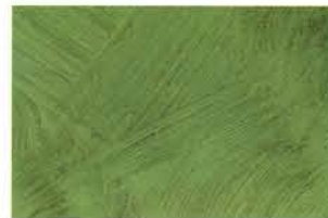
Limewashed Eternity™ PEM over Double Lemon Grass™ basecoat