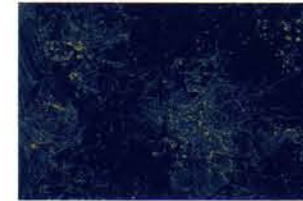
Sponged Red Damask™ PEM over Outer Space™ basecoat