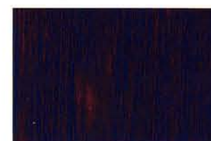
Dragged Shiraz™ PEM over Outer Space™ basecoat