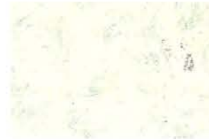
Ragrolled Midnight Express™ PEM over Wheatfield™ basecoat