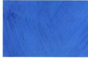
Limewashed Vortex™ PEM over Waikawa Grey™ basecoat