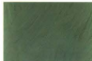
Limewashed Eternity™ PEM over Friar Grey™ basecoat