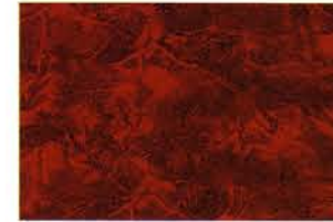
Dragged Rusty Nail™ PEM over Lusty™ basecoat