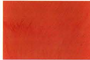
Limewashed Dynamite™ PEM over Sante Fe™ basecoat