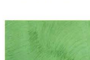
Colourwashed Mangrove™ PEM over Flax™ basecoat