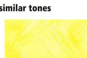
Colourwashed Tussock™ PEM over Barley White™ basecoat