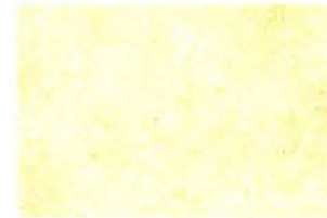
Sponged Stonewall™ PEM over Wheatfield™ basecoat