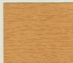
Resene Furniture and Decking Oil

Resene Furniture and Decking Oil (see Data Sheet D503) is designed for direct application to timber decks and furniture to enhance and restore the timber colour and provide protection against water, fungi and U.V. light. Popular amongst those who prefer a lightly oiled look, Resene Furniture and Decking Oil will assist with water repellency and help maintain timber in good condition. Recommended for annual application to decks and furniture.