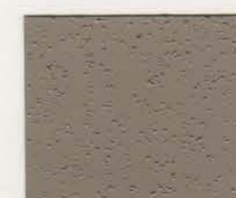
Stonewall™ with Resene SRG Grit

Where extra slip-resistance is desired, add Resene SRG Grit.