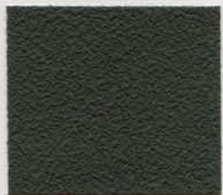
Dark Green 10TC30

Both Resene products suitable for use on tennis courts - Resene Tennis Court Coating and Resene Blacktop - dry quickly ensuring that tennis courts may be coated quickly and easily and be back into action within a few days. Use Resene Lumbersider white (see Data Sheet D34) for court markings.