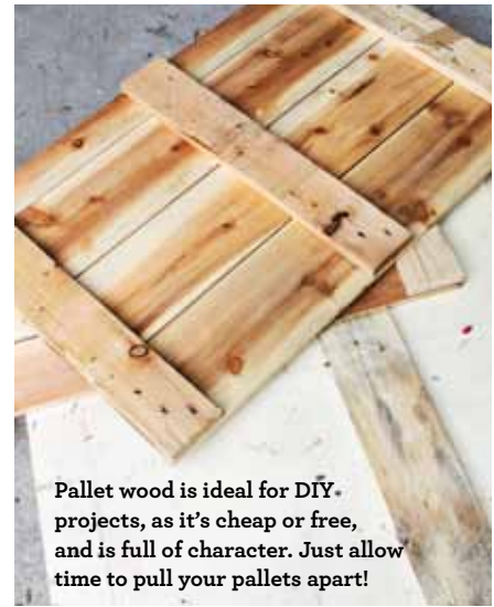
Pallet wood is ideal for DIY projects, as it's cheap or free, and is full of character. Just allow time to pull your pallets apart!