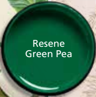
Resene Green Pea