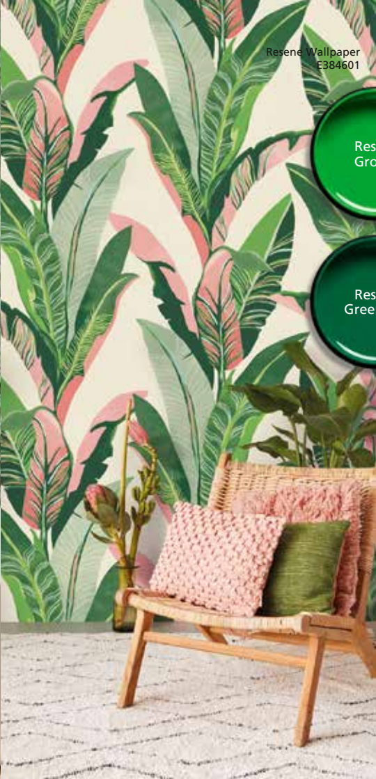
Resene Wallpaper E384601