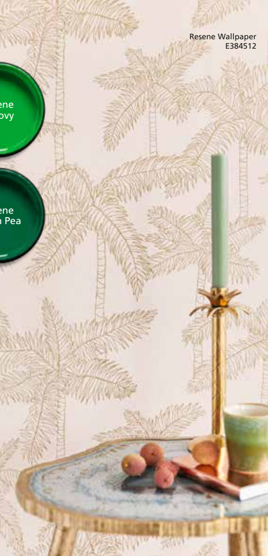
Resene Wallpaper E384512