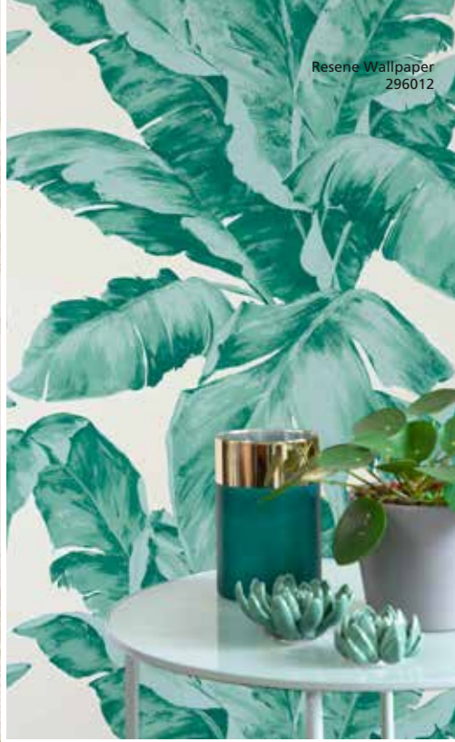
Resene Wallpaper E296012