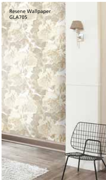
Resene Wallpaper GLA705

From delicate ferns to vibrant tropical palms – leaves, vines and branches are growing up our walls. Illustrative designs that look like they have been lifted from the pages of a plant encyclopaedia, lush sprays of palm fronds, banana plants, woodland scenes and lines of ivy appear to weave through walls. Botanicals have always been popular in wallpaper design and can be used seamlessly in everything from heritage homes to contemporary new builds. The Victorians' love of fern collecting is reflected in designs in the era. Fast forward more than a century, and the houseplant craze has seen us amassing shelves full of vegetation paired with lush leafy wallpaper designs. Being surrounded by nature is calming, and bringing a little greenery into your home will help to ground your interior design while lifting your spirits.