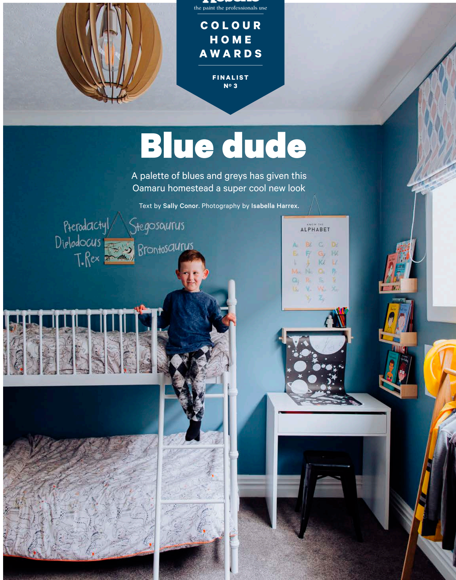
ABOVE Luca's room is painted in the ice-inspired blue of Resene Avalanche. OPPOSITE Clockwise from top left Resene Ash, Resene Duck Egg Blue and Resene Lynch.

Text by Sally Connor. Photography by Isabella Harrex.